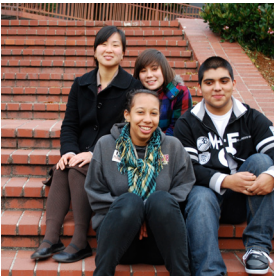
What Do We Mean When We Talk About Positive School Climate?