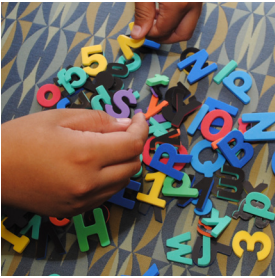
Improving Outcomes and Practice